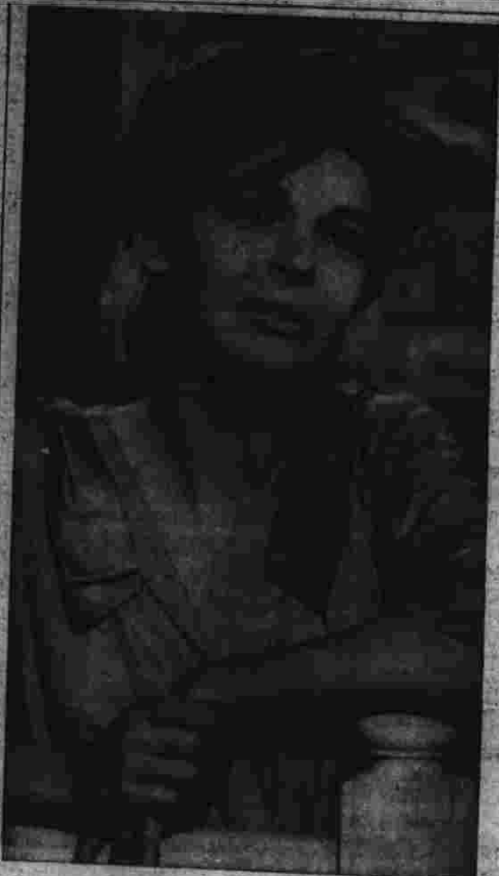
Oscar-winner Anne Bancroft in a scene from "Out on the Outskirts of Town," the first television drama by the noted playwright William Inge. The drama will be presented on NBC's "Bob Hope Presents the Chrysler Theatre" Friday from 8:30-9:30 p.m. Inge is the author of "Come Back, Little Sheba" and "The Dark at the Top of the Stairs."