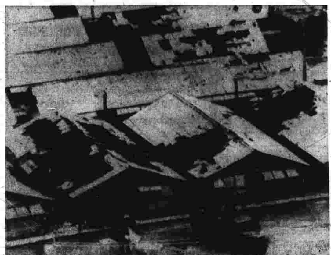
Gaping holes were blasted in U.S. Army barracks at the Bien Hoa Air Base in Viet Nam in newest Viet Cong raid. An air view shows some of the damage to the buildings. Four Americans were killed and 29 wounded.

WASHINGTON (AP)—The long, strident election campaign comes to a close today with every indicator of a computerized, poll-conscious era pointing toward victory for President Johnson.